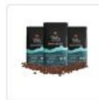
Monthly Subscription - Ethiopia Light Roast (+FOCUS)