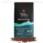
BRAIN SUSTAIN Light Roast